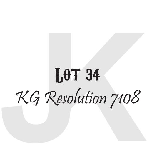
LOT 34 KG Resolution 7108