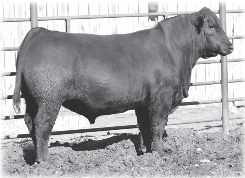
LOT 36 KG Justified 7175