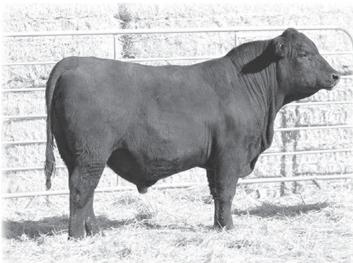
LOT 85 KG Dividend 7489