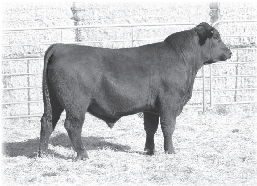
LOT 80 KG Dividend 7554