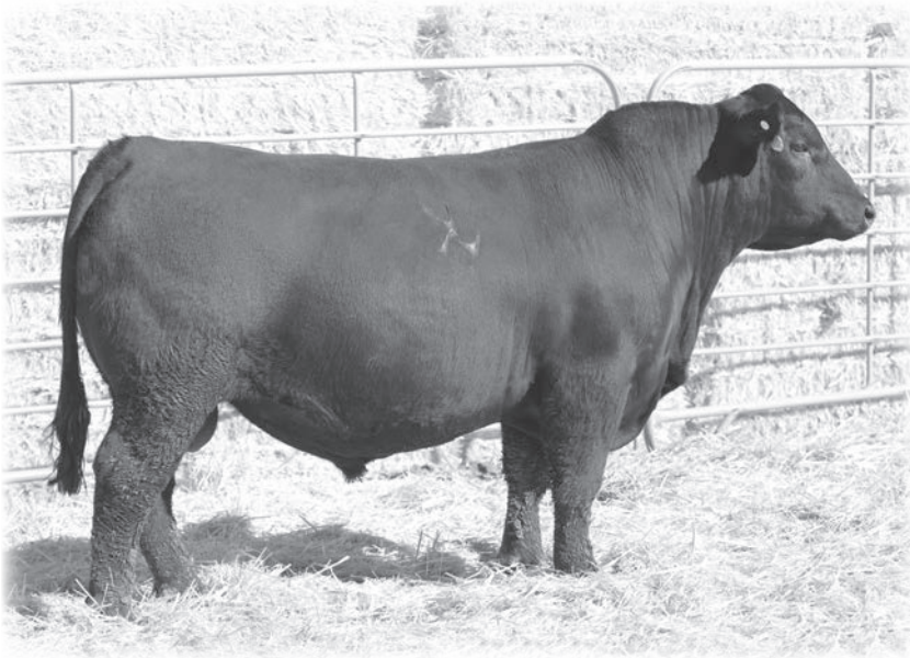
LOT 45 KG High Regard 7010