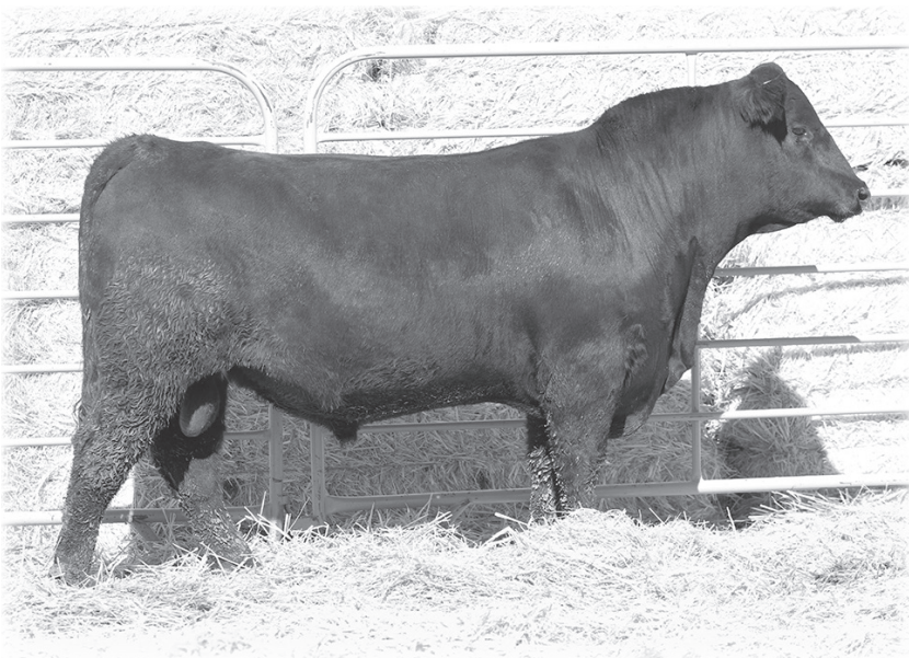
LOT 48 KG High Regard 7330