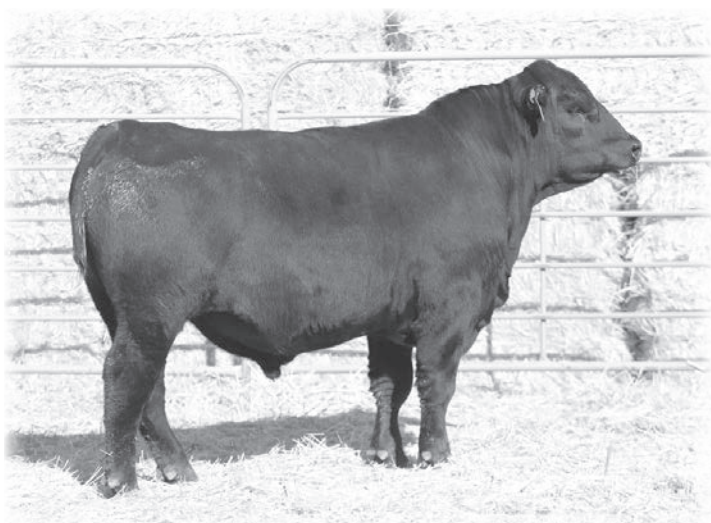
LOT 207 KG Dividend 7066