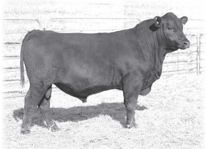
LOT 172 KG Investment 7780