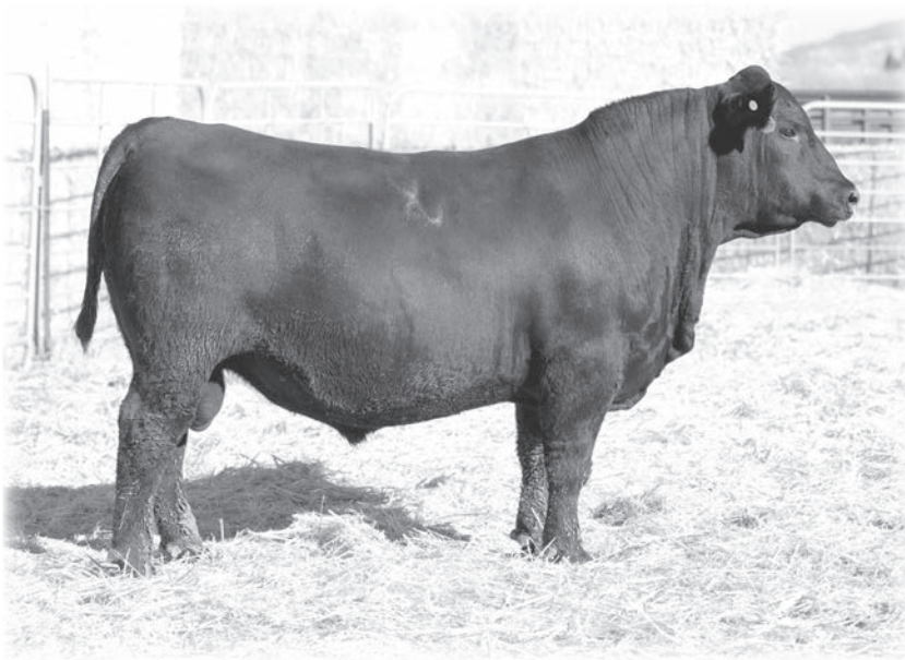
LOT 15 KG Source 7590