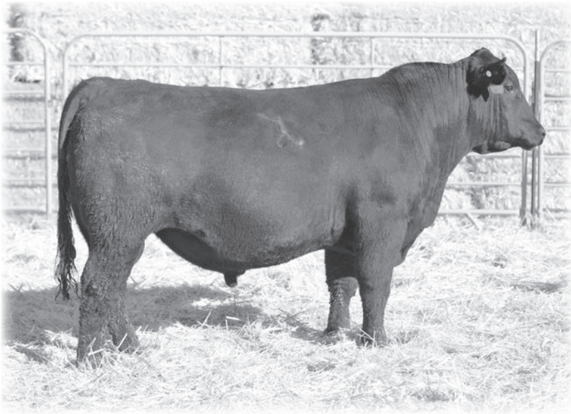
LOT 33 KG Resolution 7061