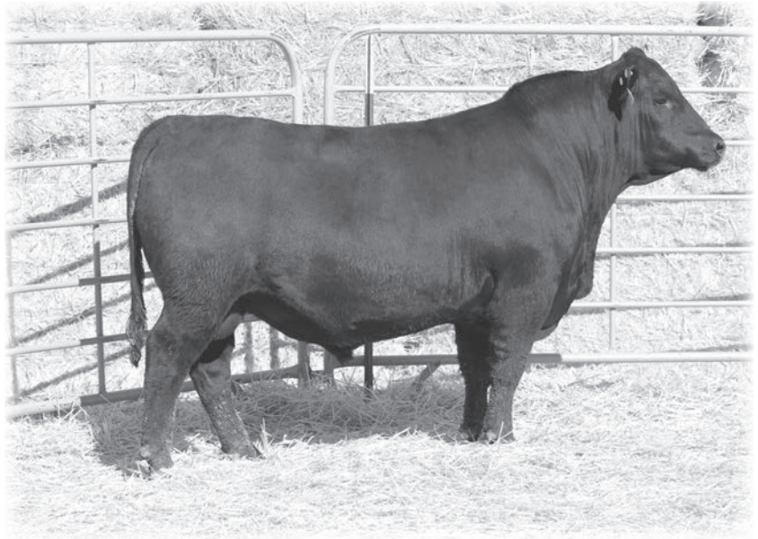
LOT 13 KG Source 7126