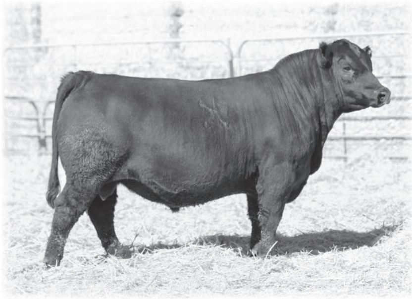
LOT 51 KG High Regard 7057