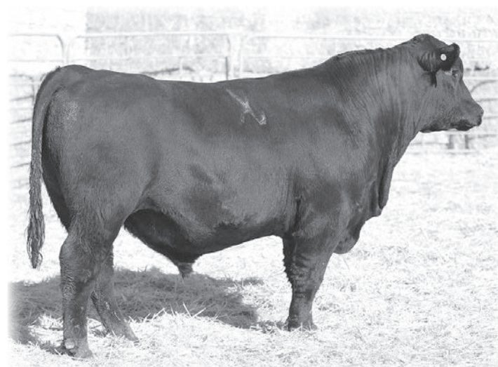
LOT 213 KG Dividend 7005