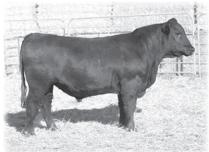
LOT 87 KG Dividend 7094