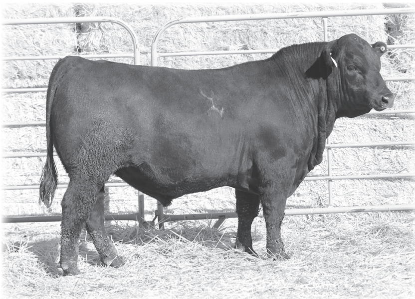
LOT 54 KG High Regard 7173