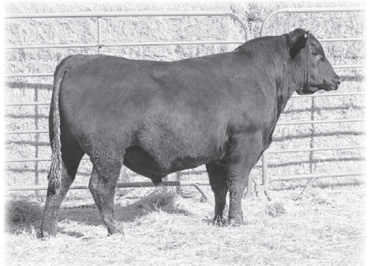
LOT 193 KG Source 7655