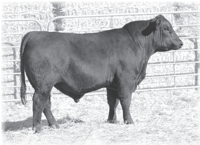
LOT 81 KG Dividend 7025