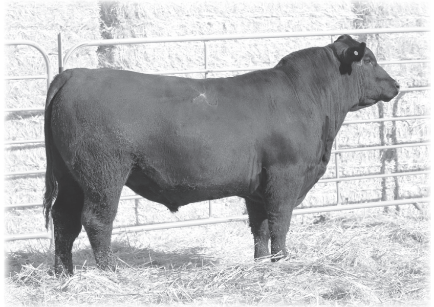
LOT 53 KG High Regard 7349