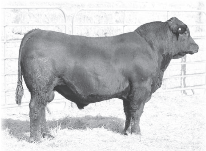
LOT 191 KG Source 7579