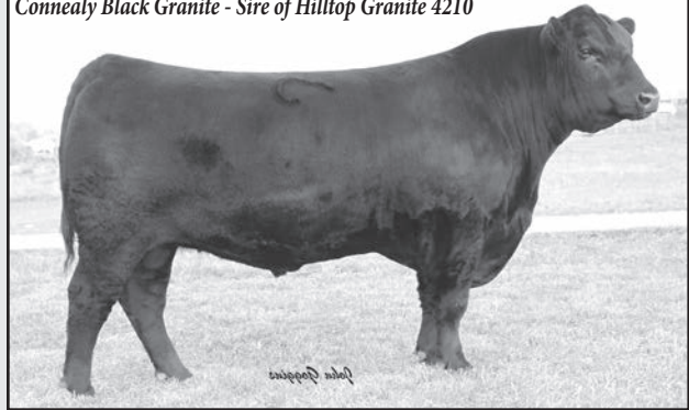
Connealy Black Granite - Sire of Hilltop Granite 4210