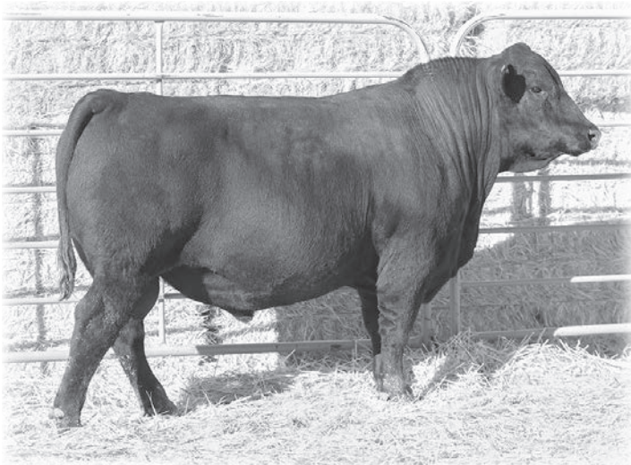
LOT 170 KG Investment 7816