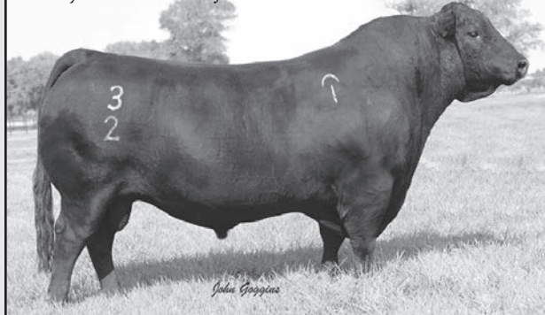
Connealy Countdown - Sire of Vermilion Countdown C219